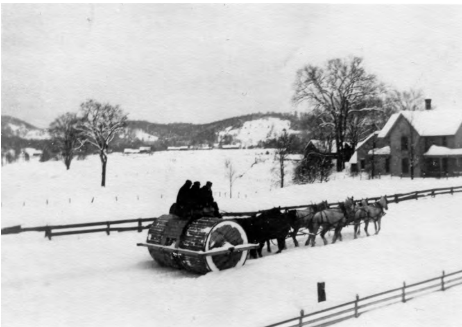
Snow roller, Post Mills

Before snow plows, the snow roller kept the roads fairly smooth. It took a team of six horses and had a tendency to slide into ditches. Covered bridges were another matter: to allow sleighs to travel through them, snow had to be added to make the surface passable.